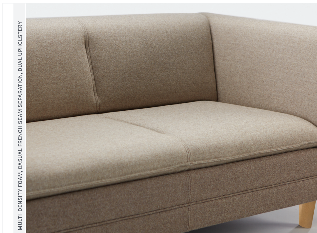
MULTI-DENSITY FOAM, CASUAL FRENCH SEAM SEPARATION, DUAL UPHOLSTERY

LEARN MORE ABOUT WATSON AT ALLSEATING.COM