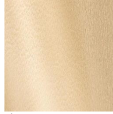
Elegance Grade: L2