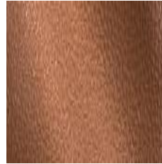
Bull Soft Grade: L2