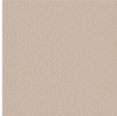
Madras Grade: L1