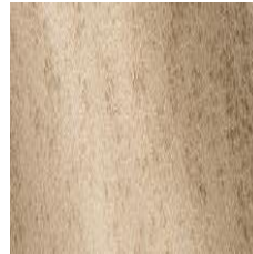
Mardi Gras Grade: L2