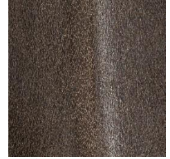
Capri Grade: L2