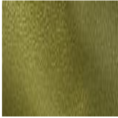
Santiago Grade: L1

For fabric information and colourways for each collection, click the swatch.