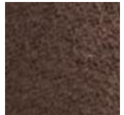
Paradiso Grade: L2