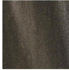
Stagecoach Grade: L2