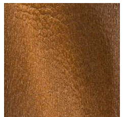
Roxy Grade: L2