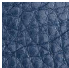
Queensland Grade: L2