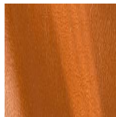
Rio Grade: L2