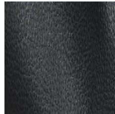
Dublin Grade: L2