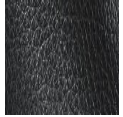
Valencia Grade: L2