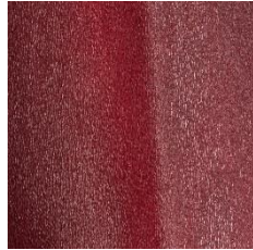
Barolo Grade: L2