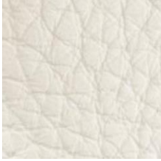
Atlantis Grade: L2

For fabric information and colourways for each collection, click the swatch.