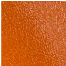
Classico Grade: L3