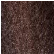
Heritage Grade: L2